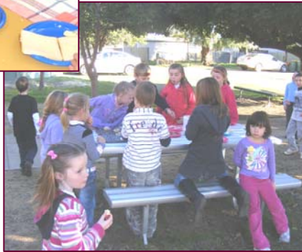
Enjoying our party food outside