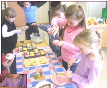
Icing our cakes

This week our focus sounds are – “oa” as in boat, “all” as in ball and “i” as in insect.