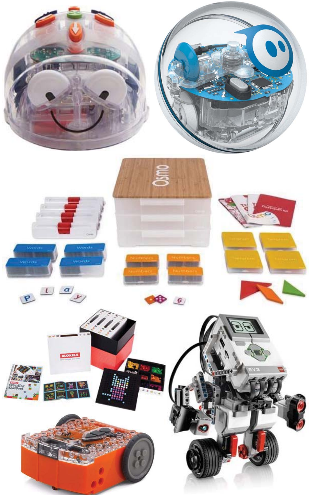
Pictured are some of the exciting new resources purchased for teaching Science, Technology, Engineering and Maths (STEM).

Our annual Presentation Evening will be held on Thursday 13th of December. Please note that this is a change of date from the original notice given.